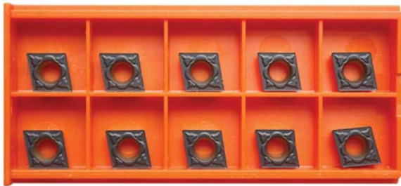
Carbide Insert CVD Coated DNMG432 Black/Yellow #2206-1028