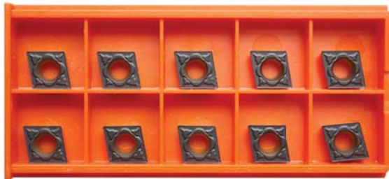
Carbide Inserts CVD Coating DNMG432 Black/Yellow #2206-1028