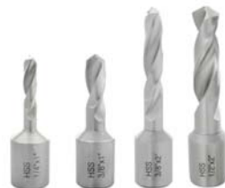
SSP0-0014 SSP0-0038 SP10-0038 SP10-0021