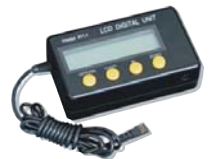
Item # 1104-8111